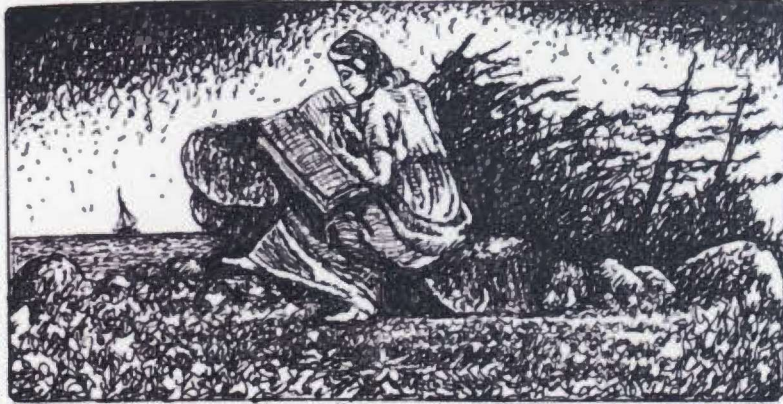
Figure adapted from Thomas Bewick (English, 1753-1828) c.1790's